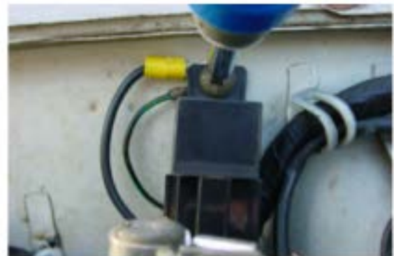
Mounting of Relay