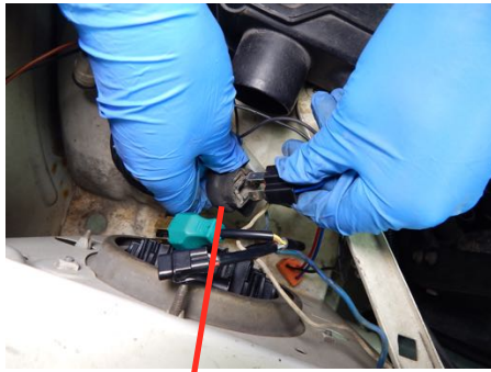
OEM Passenger Side Female Headlight Connector